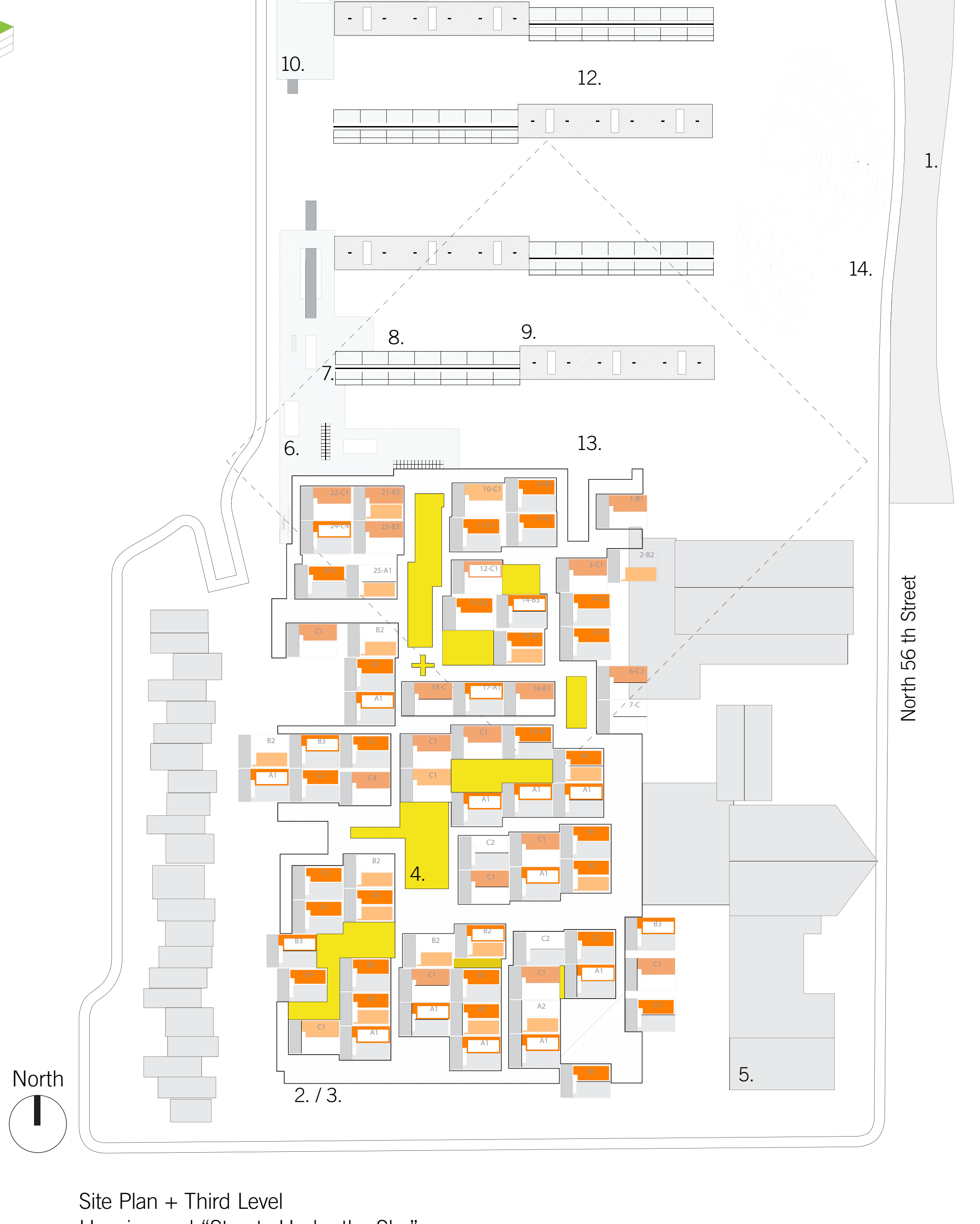
Housing and "Streets Under the Sky"

Bike Path / Electric Car Charging / New Street Paving